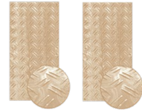
Use DuraDeck 1 & 4 for Vehicles (DuraDeck 1 shown)

DuraDeck 4: Rugged on one side, smooth on the other. Designed for use in loading areas or construction sites with heavy vehicle traffic on muddy surfaces.