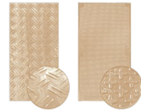
Use DuraDeck 2 & 3 for Vehicles/Pedestrians (DuraDeck 2 shown)